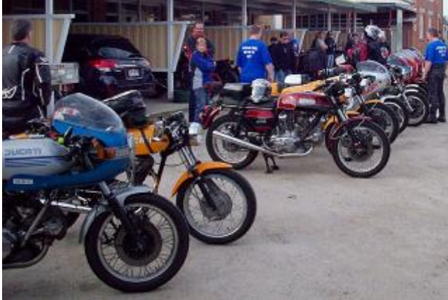
Ducati's fill the Royal Hotel/motel in Tenterfield