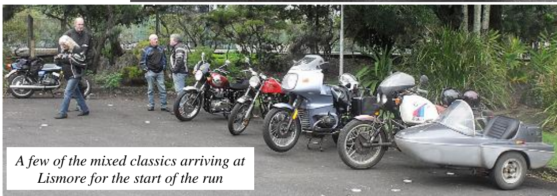
A few of the mixed classics arriving at Lismore for the start of the run