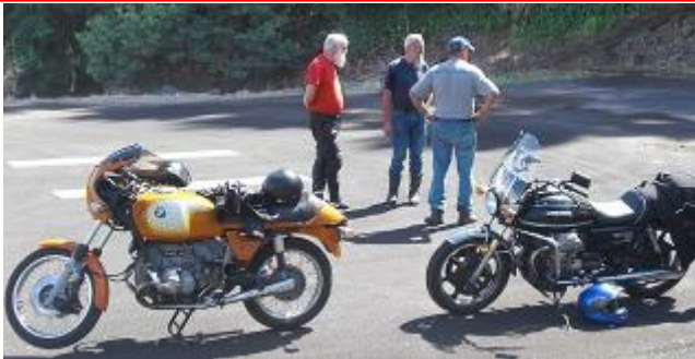
Just a few of the beautiful “Classic Motorcycles” ridden on the April Club run to Toonumbar dam.