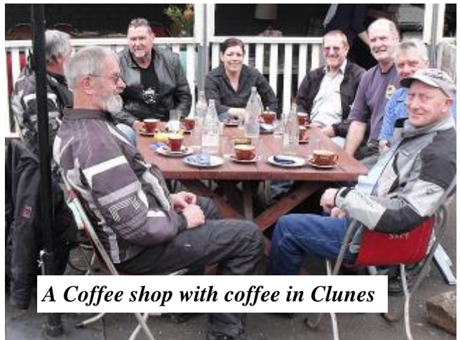
A Coffee shop with coffee in Clunes