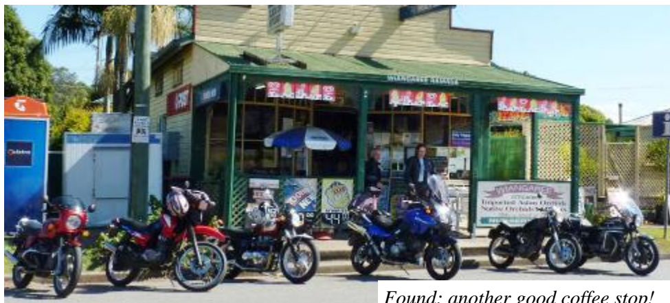
Found; another good coffee stop!

The Run Route chosen was via Cawongla/Rock Valley Road, north from Lismore and from there to Kyogle and then onto the Summerland Way to Wiangaree (or Wiangaree - if you are historically correct as regards the old maps.) The ride was un-eventful, but towards the end it was