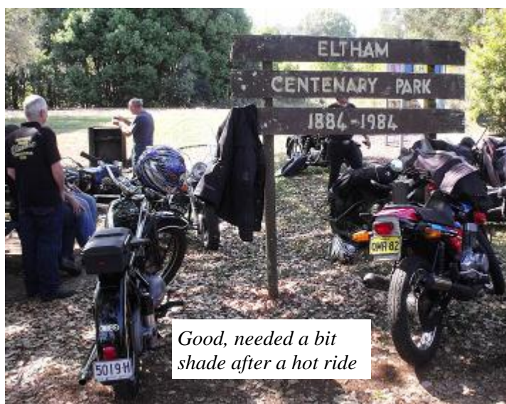
Good, needed a bit shade after a hot ride