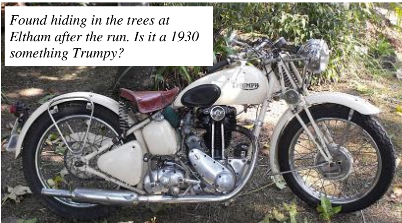
Found hiding in the trees at Eltham after the run. Is it a 1930 something Trumpy?