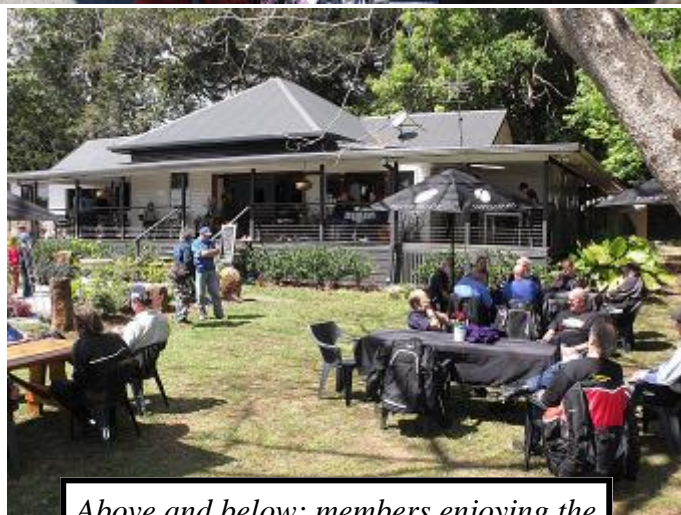
Above and below: members enjoying the good coffee in the picturesque setting of Alstonville Garden House nursery.