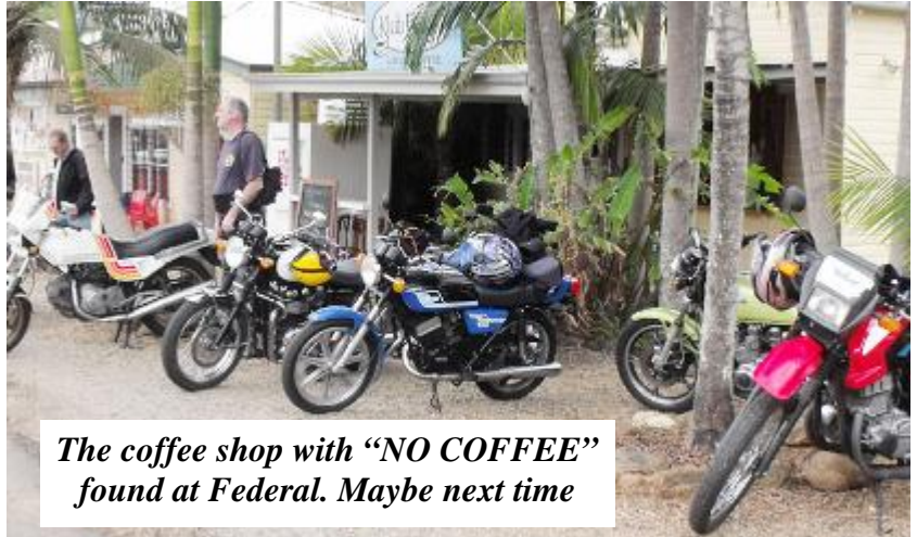
The coffee shop with "NO COFFEE" found at Federal. Maybe next time