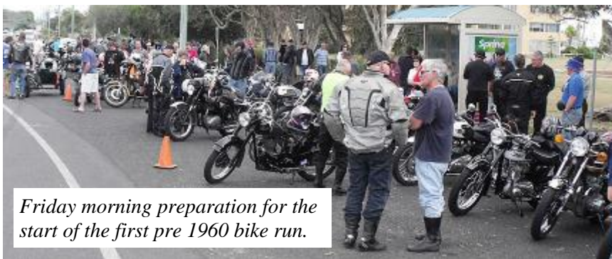
Friday morning preparation for the start of the first pre 1960 bike run.