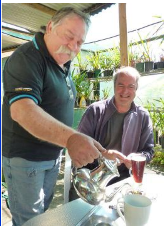
Only silver service is good enough for the riders at the Wiangaree Store.