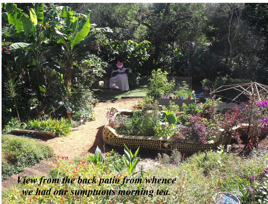
View from the back patio from whence we had our sumptuous morning tea.