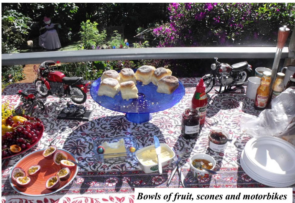
Bowls of fruit, scones and motorbikes