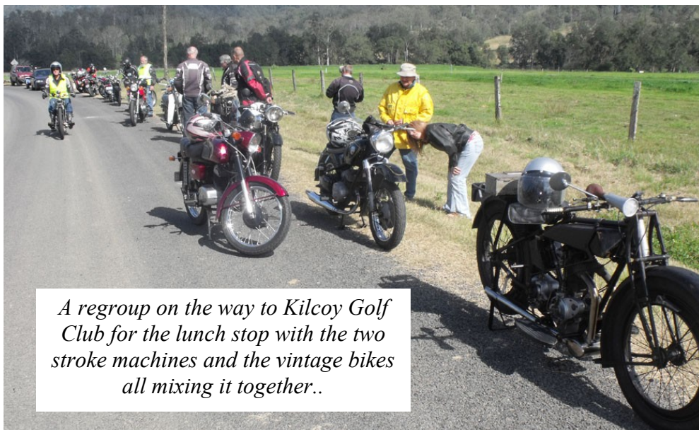
A regroup on the way to Kilcoy Golf Club for the lunch stop with the two stroke machines and the vintage bikes all mixing it together..