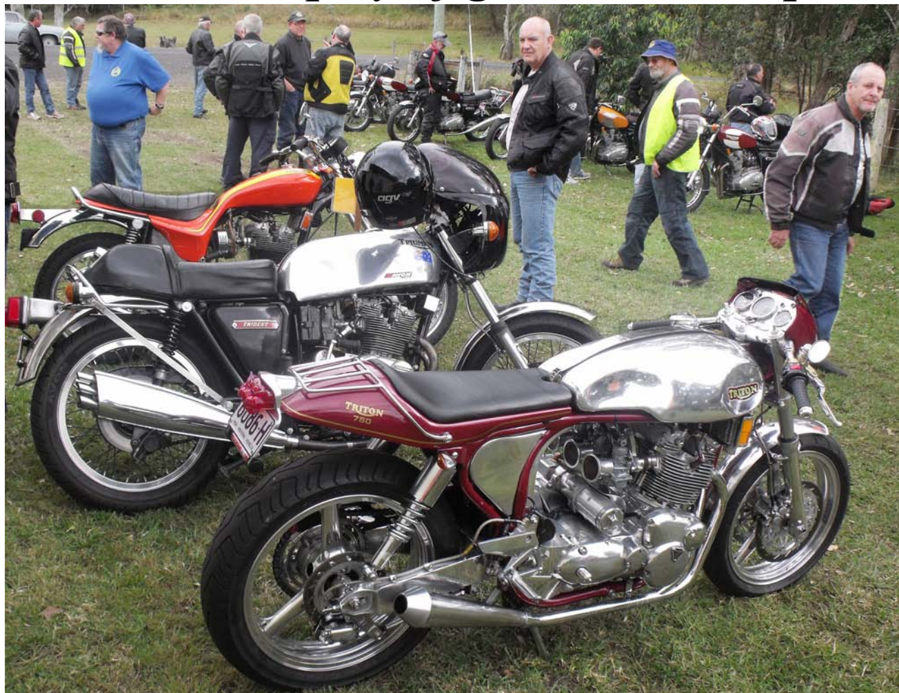
As seen at Bentley on the Saturday, voting for the best bike was no easy matter