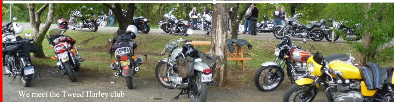
We meet the Tweed Harley club