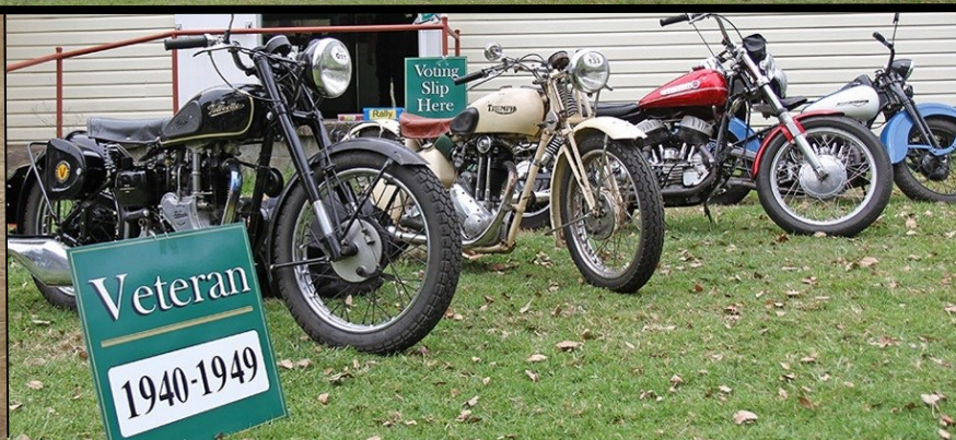
More pics from the 2013 rally —lunch stop at Bentley Hall. There are more on 'photobucket' There was good mix of bikes on the run.