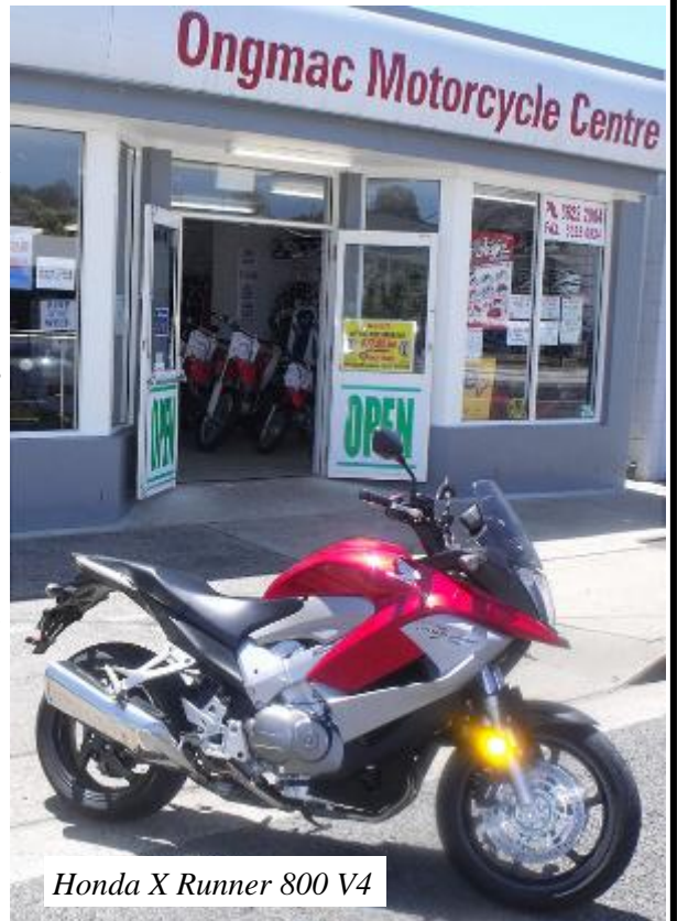
Honda X Runner 800 V4

Left: the mid-week group preparing to leave Lismore rail. Below: seated at the Nursery Coffee shop, Sextonville Road.