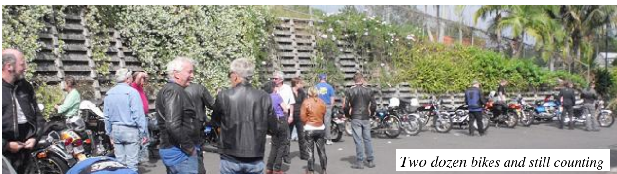
Two dozen bikes and still counting