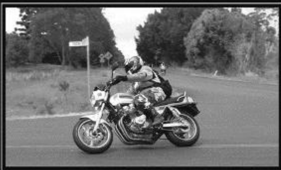
Northern Rivers Classic Motorcycle Club Inc. Annual Rally - 2011