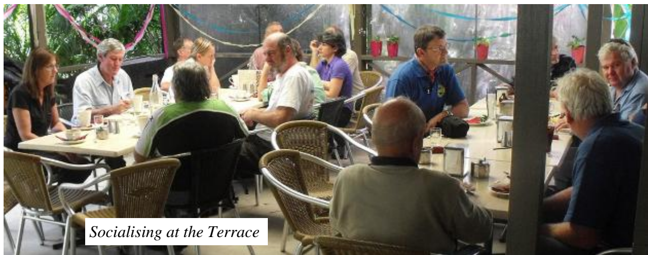
Socialising at the Terrace